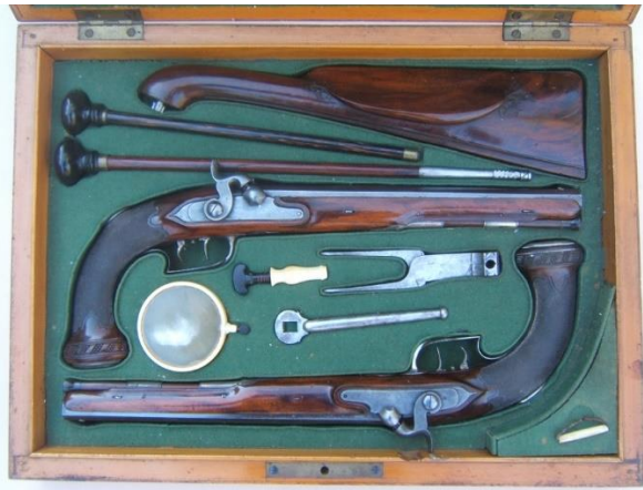
Ca. 1850s Howdah Pistol – with detachable stock

http://www.hallowellco.com/historical_gallery_antique%20guns.htm